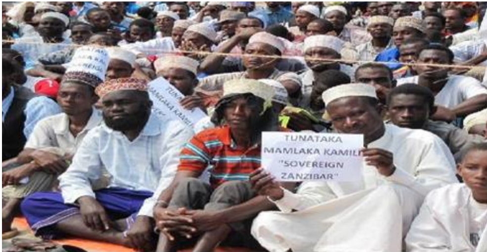
Figure 9: UAMSHO activists at a rally holding placards demanding sovereignty

Here, Sheikh Ali was employing populist rhetoric to explain his opposition to the Union, arguing that from the time of creation of the Union, the majority of Zanzibar people were not committed to it, and that the major issue of contention was that of sovereignty.