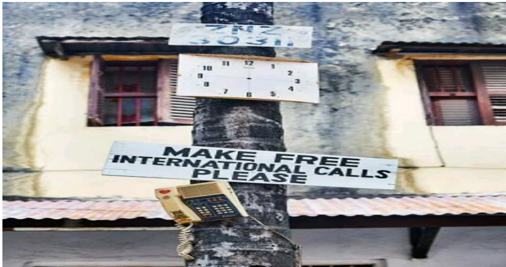
Figure 5: Interesting sign inviting free international calls however the telephone was not a working set.

Mazrui (2001) stresses that modern technology has provided Islam with a new opportunity to accomplish its goal of a universal community of believers in a new way. Further, he argues that the network of relationships created has given new energy to the transnational nationalism of the Muslim Ummah, with a leadership drawn mainly from the ranks of middle class. My study found that there is indeed an increased level of the UAMSHO activists' use of social media sites such as YouTube, where officials post speeches.