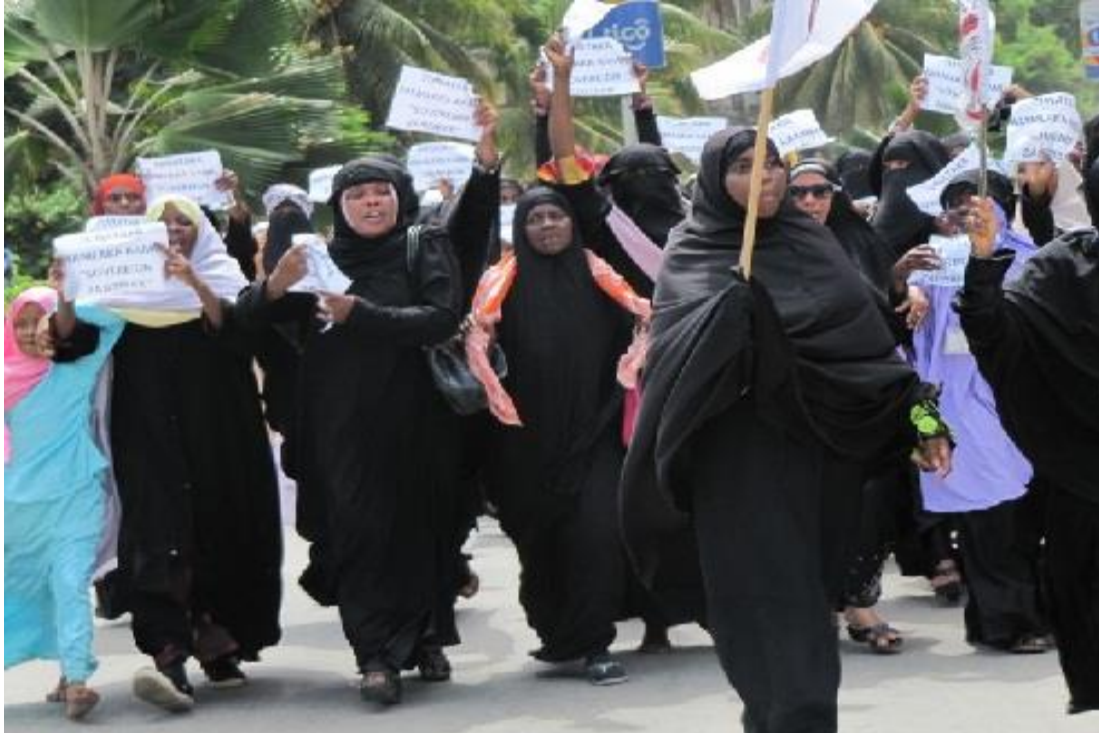
Figure 4: Women activists participating in a rally in 2004