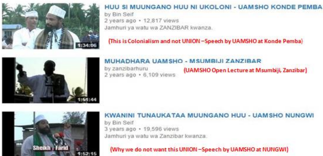
Figure 3: Some of the UAMSHO's YouTube videos indicating number of views as of 2012.

question definitely technology has brought us closer as a group and afforded us tools that we never had before, where it is so easy to mobilize my group right now.