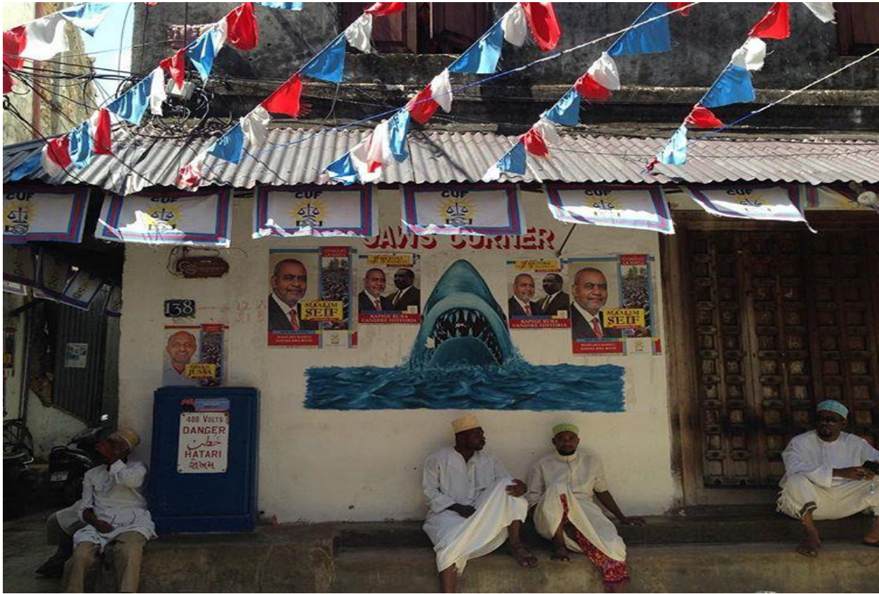
Figure 2: Jaw's corner with CUF's flags and election posters.

Jaw's Corner was a significant site for UAMSHO formation. There members got easy access to internet through the available café in the courtyard or among many in the walking distance from the courtyard. Further, it should be noted that the readily available accessibility of internet helped the activists in their quest to communicate and receive vital information from their supporters around the world. In 2004, approximately 85% of activists (34 out of 40) I spoke with had email addresses and not only knew how to navigate their way through the internet but also read news and obtained other information through internet. Therefore, the access to the internet allowed activists to access different listservs, and free blogspots. This was supplemented by the fact that all activists I spoke with had cell phones and were communicating in the group through mass text messaging or conference calling.