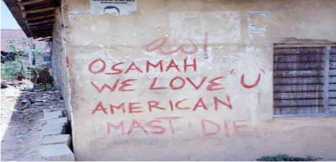
Figure 7: I took this picture on the outskirts of Zanzibar, a graffiti lending support to Osama bin Laden. This is an example of Muslim ummah, where a Muslim brother grievance is for all, especially if one is fighting the 'infidels'.

Most of the UAMSHO activists told me in 2004 that they follow what their clerics tell them to do, because they have to follow the fundamentals of their religion for Zanzibar to achieve self-rule. Once Zanzibar achieves its independence, it will be easy for the country to reach its potential and solve most of the societal issues it is currently facing. The activists insisted that they will do whatever is necessary to achieve independence, even using bombing to get the attention of the government. Most UAMSHO activists I interviewed thus expressed their support for Al Qaeda and other radical Islamic groups.